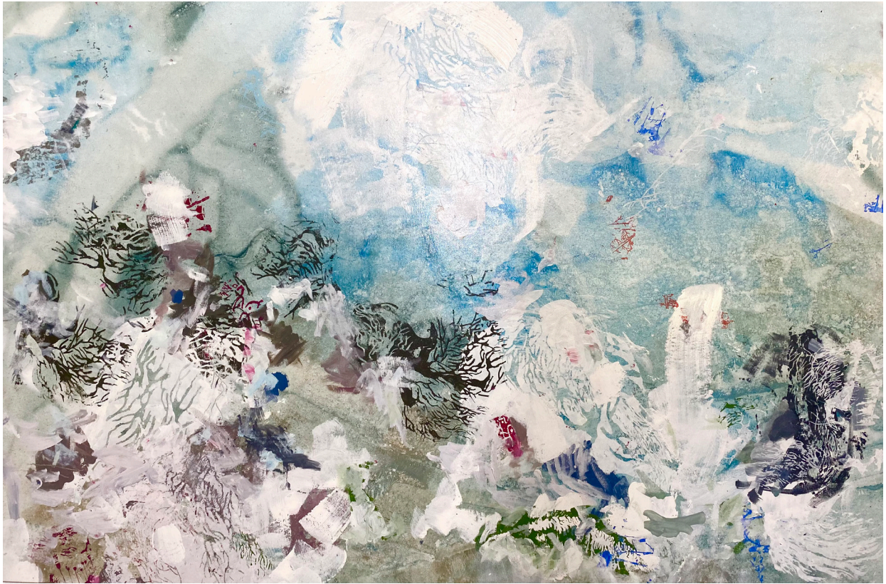
Amélie Ducommun, Melody of memories #2 , 2023, mixed media on canvas, 130 x 195 cm