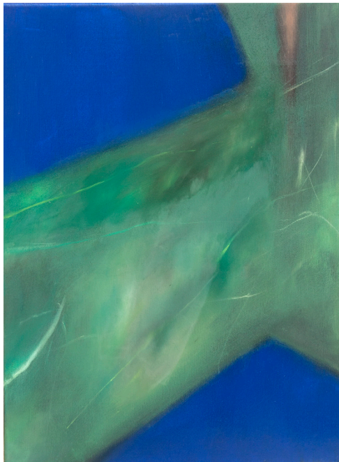
Pascal Berthoud Two structures in the sea , 2024 Oil on canvas 55 x 40 cm

Exploring her own artistic philosophy centered on a contemplation of astronomy and the abstract representation of our vast sky, Eline Botta (Swiss b. 2000) offers glimpses into distant cosmic realms, engaging in a nuanced exploration of how celestial phenomena can be translated and captured in the complex landscape of the mind. Moving between materiality and the abstraction of form, Botta's process becomes a captivating journey, seeking to reconcile tangible elements with the ethereal nature of the cosmos.