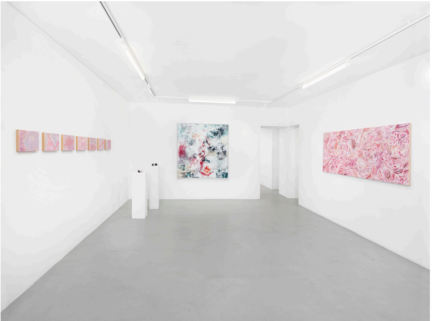
Installation view.